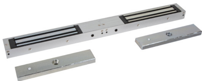
ML600-D / ML600-D-M